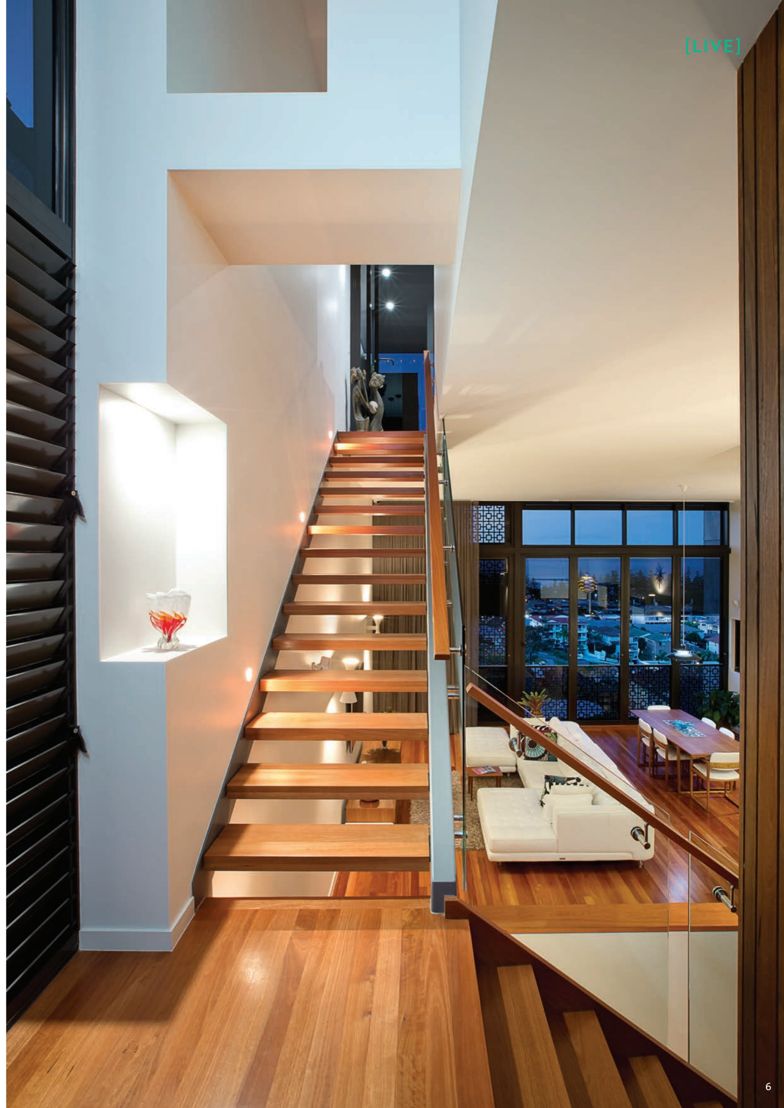
1. Dining 2. View from the street 3. Mastersuite Deck 4. Master Bedroom 5. Master Bedroom Ensuite 6. Connecting spaces. More images can be viewed at our online magazine – www.indulgemagazine.net

The clients knew how they wanted to live and feel inside their new home; they also came to Jamison Architects with strong ideas about their love of 1960s furniture, art and décor. They simply needed someone to create the space for them to carry out their ideal lifestyle. Pertinent to the renovation was an extra level for a luxurious one-level bedroom, ensuite and sitting areas. Essential also to the brief was to take advantage of a