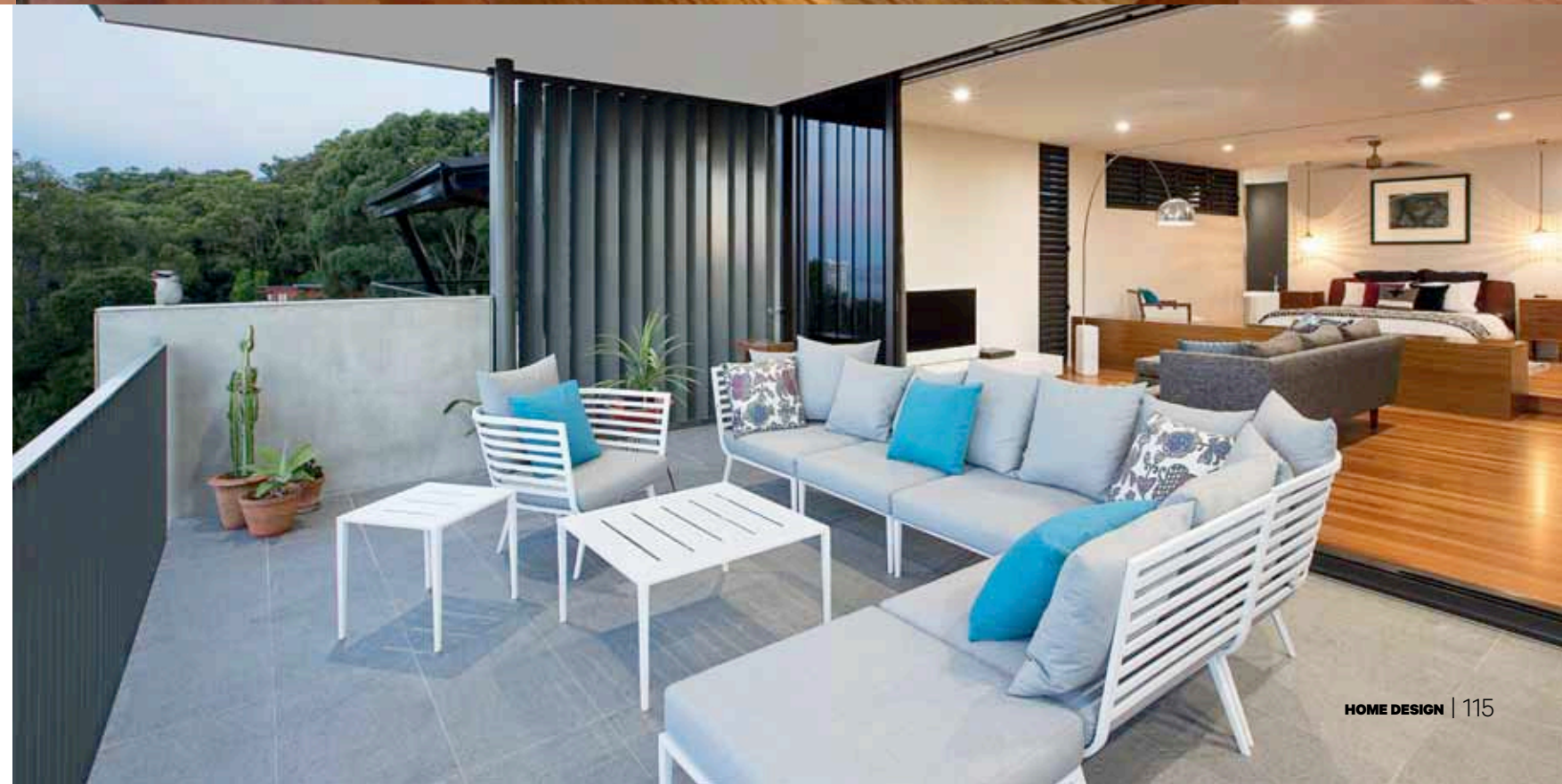
OPPOSITE BELOW The outdoors can be enjoyed with ease from the master bedroom suite