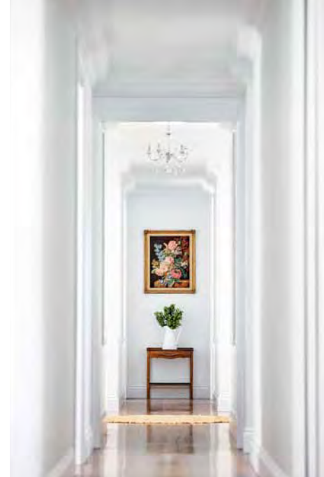
ABOVE Each hallway is beautifully framed with vintage-look cornices

The dwelling's layout is akin to a boomerang, with the orientation of the living wing designed to maximise the best solar aspect as the solar panels also sit on this wing. The home is protected from the harsh sun where needed with verandahs, pergolas and overhangs.