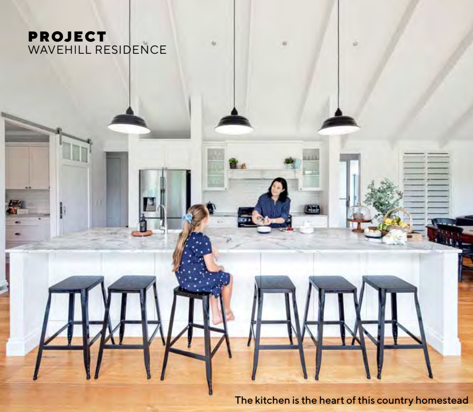
The kitchen is the heart of this country homestead